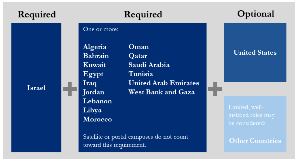
Figure 1. Eligible consortia

Limited, well-justified roles may be considered for recipients in other countries eligible to receive U.S. foreign assistance. See Figure 1.